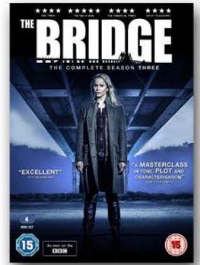
The Bridge, S3 E1

How to use: Use this Knowledge Organiser to compare and contrast these television products. Highlight the similarities and differences.